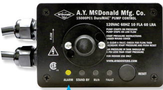
Voltage Alarm Light